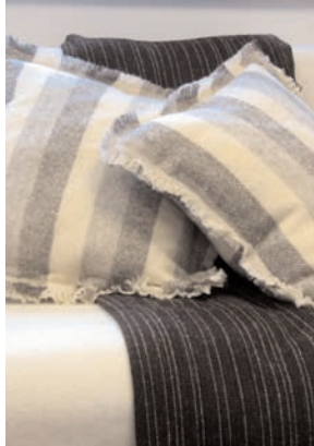
Mixed-breed throw with cushions

The ever-popular Jacob-mohair striped blankets have