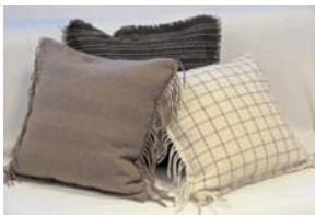
Mixed-breed cushions. Contact us for manufacturing details

sold out and more have been ordered, which will be in stock soon. They can be cut and hemmed to suit: baby, knee, single or double. Let us know your requirements.